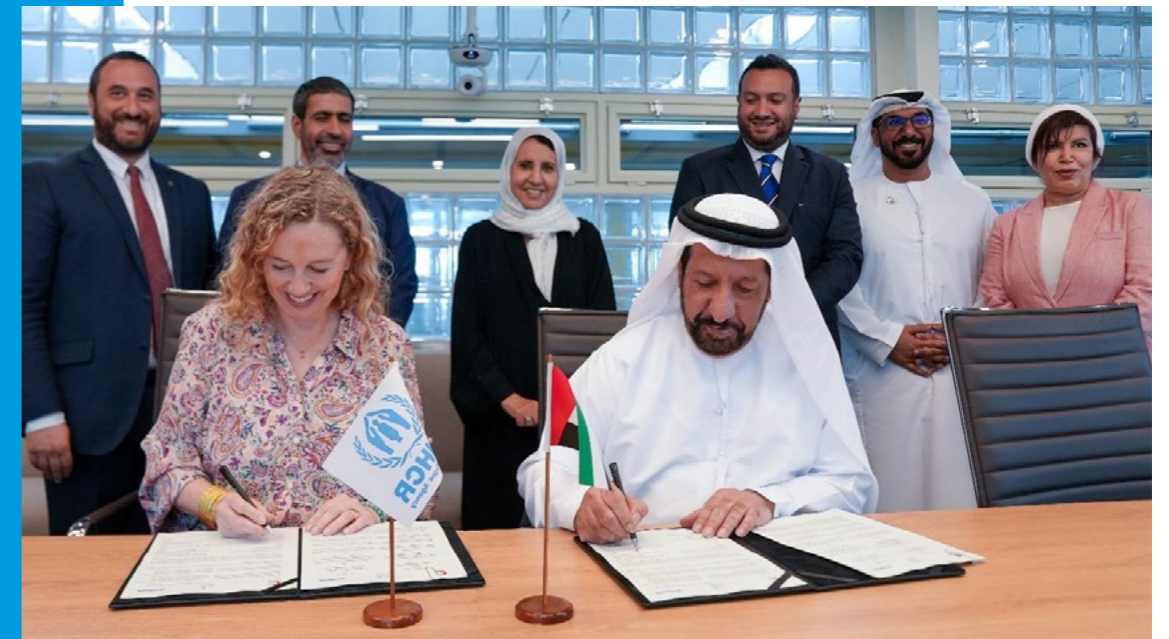
United Arab Emirates, SFFWR Geneva Agreement Signature Shelter Projects in Chad and Burkina Faso. Aug 2024