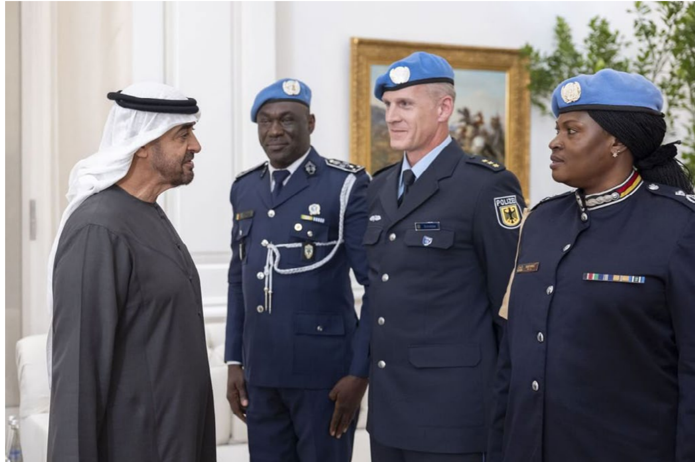
President His Highness Sheikh Mohamed bin Zayed Al Nahyan meets with senior UN officials and international law enforcement leaders during the UN Chiefs of Police Summit regional event, underscoring the UAE's commitment to global security cooperation.