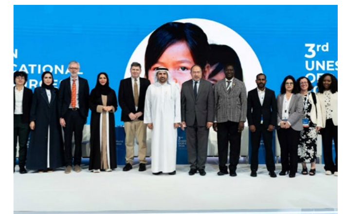
The 3rd UNESCO World Open Educational Resources (OER) Congress in Dubai highlighted the role of digital public goods and AI in expanding inclusive access to knowledge and advancing the 2030 Agenda.