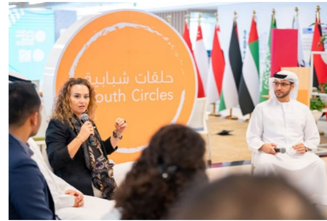
UN Resident Coordinator Bérangère Boëll participates in the COP29 Youth Circle, organized by the Arab Youth Council for Climate Change, to exchange ideas with young climate leaders on advancing regional action and youth engagement ahead of COP29.