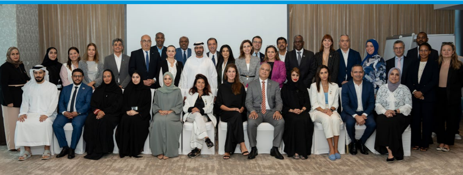
UN Country Team members at the 2024 Strategic Planning Retreat in Dubai, joined by H.E. Sultan Al Shamsi, Assistant Minister of Foreign Affairs for Development Affairs and International Organizations, working together to strengthen collaboration and accelerate progress towards the SDGs.

The United Nations Country Team (UNCT) in the UAE is composed of over 30 agencies, funds, and programs that either have a physical presence in the country or operate from regional or subregional hubs with a mandate that includes the UAE. This unique configuration aligns with the principles of UN Reform, ensuring tailored support and expertise to address the UAE's national priorities and strategic ambitions.