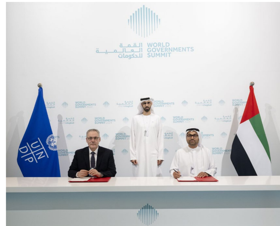
UNDP and the UAE Ministry of Artificial Intelligence, Digital Economy, and Remote Work Applications sign an MoU to strengthen collaboration on leveraging AI and digital innovation to accelerate the Sustainable Development Goals.