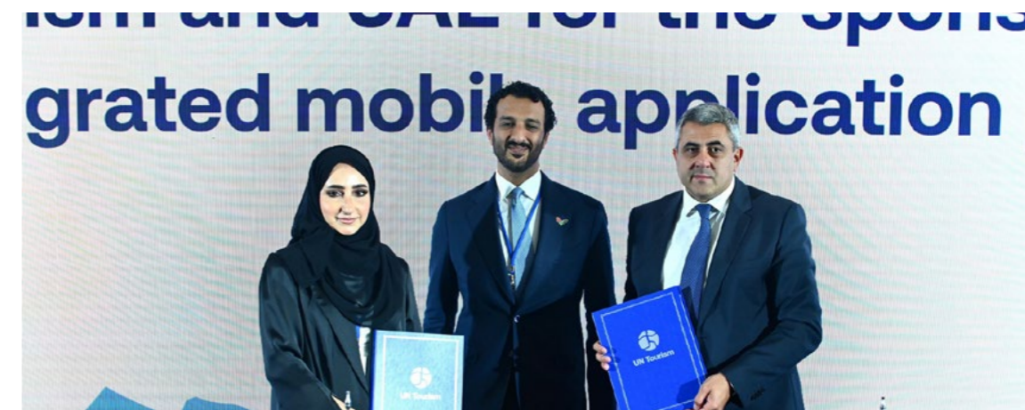
UN Tourism and the UAE Ministry of Economy formalize their partnership to strengthen national tourism statistics and advance sustainable tourism development through a signed Memorandum of Understanding.