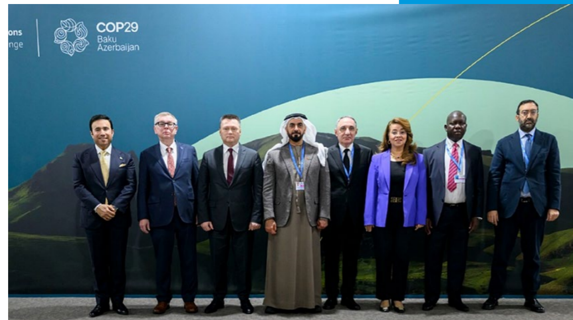
The UAE Ministry of Interior and UNODC collaborated at COP19 to advance regional cooperation and strengthen efforts to combat organized crime and promote international security.