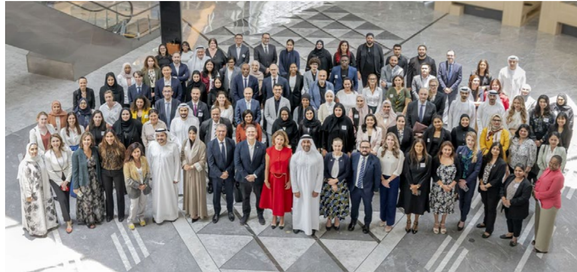
Participants of the private sector SDG workshop co-hosted by UN Global Compact UAE and the National Committee on SDGs, to strengthen public-private collaboration for the 2030 Agenda.