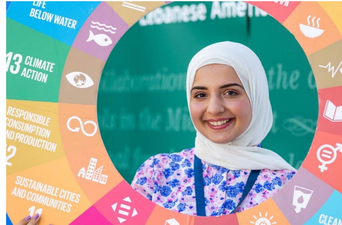
As part of the Knowledge Project, MBRF and UNDP launched the Future Skills Academy to empower individuals across the Arab world by enhancing their skills and knowledge, contributing to sustainable development in the region.