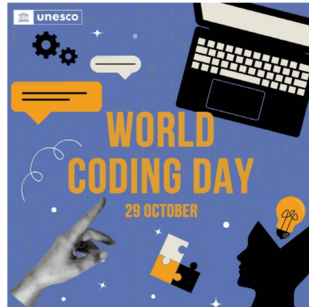
World Coding Day was celebrated for the first time globally and in the UAE, following a UAE-led initiative adopted at UNESCO's General Conference.