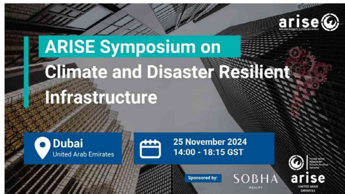
The ARISE Symposium on Climate and Disaster Resilient Infrastructure brought together over 120 leaders from public and private sectors to strengthen global resilience efforts.