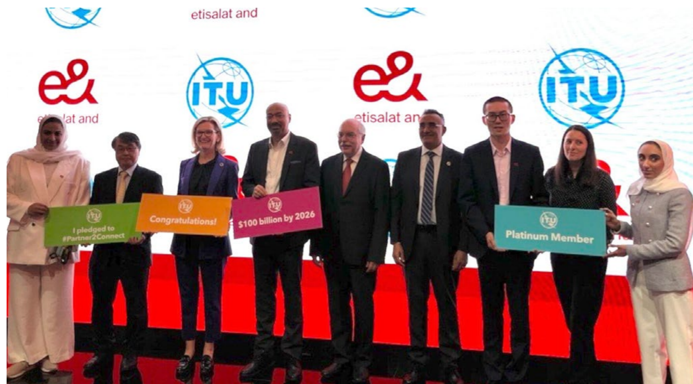
ITU Partner2Connect (P2C) session, highlighting global efforts to expand meaningful connectivity and digital inclusion, with contributions from UAE-based partners including e& (Etisalat Group).