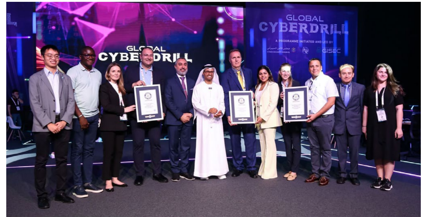
Celebrating the Global CyberDrill's Guinness World Record for international diversity—led by ITU and the UAE Cybersecurity Council to strengthen global cyber cooperation.