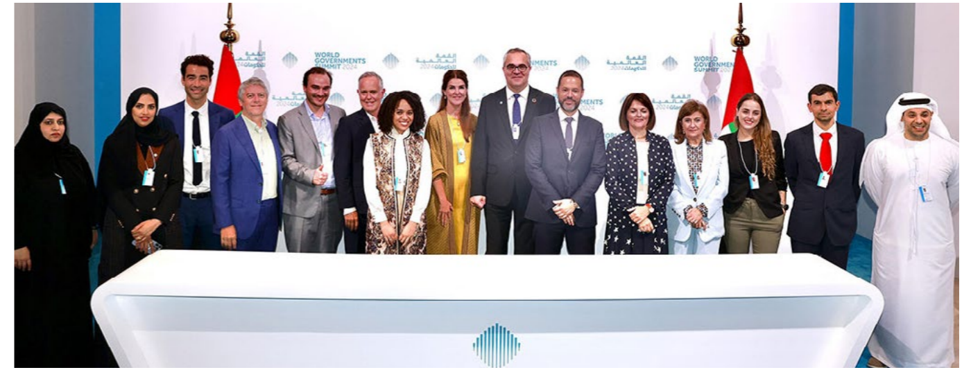
UN-Habitat and Dubai Municipality conclude the 13th cycle of the Dubai International Best Practices Award for Sustainable Development at the World Governments Summit 2024.