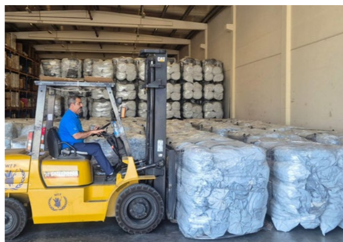
At the heart of global emergency response, WFP's UNHRD hub in Dubai—supported by the UAE and over 100 partners—enables rapid delivery of life-saving aid to communities in crisis.