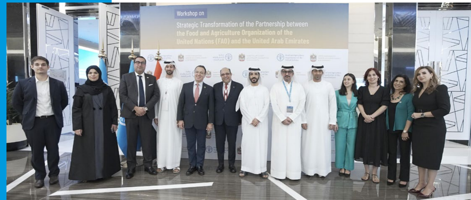
The FAO–MOCCA strategic partnership workshop in Dubai underscored joint efforts to advance sustainability and strengthen food systems collaboration.