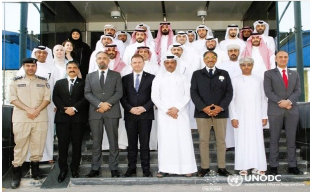
Emirati officials trained on advanced AI tools to combat online drug trafficking during a regional workshop co-organized by UNODC, GCC-CICCD, and the UNODC Cybercrime Centre in Doha.