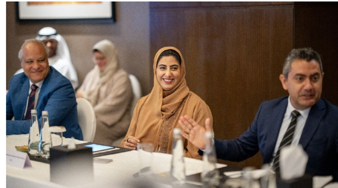
UNHCR and the UICCA high-level roundtable on climate displacement.