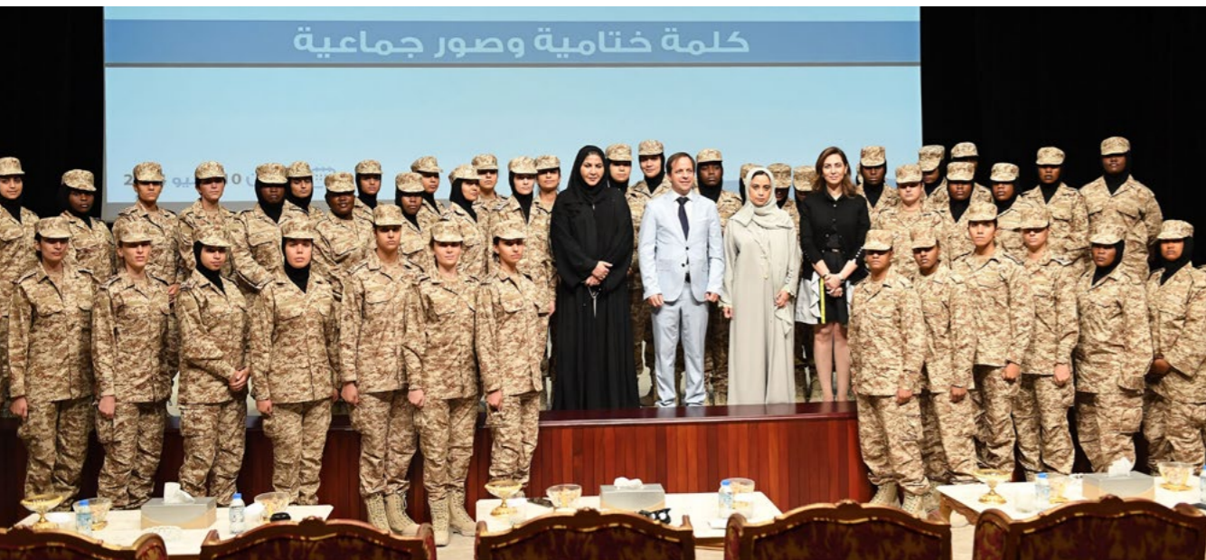
Graduates of the fourth cohort of the Sheikha Fatima bint Mubarak Women, Peace, and Security Initiative celebrate their achievement, marking continued collaboration between UN Women and UAE partners to empower women in peacekeeping and security roles.