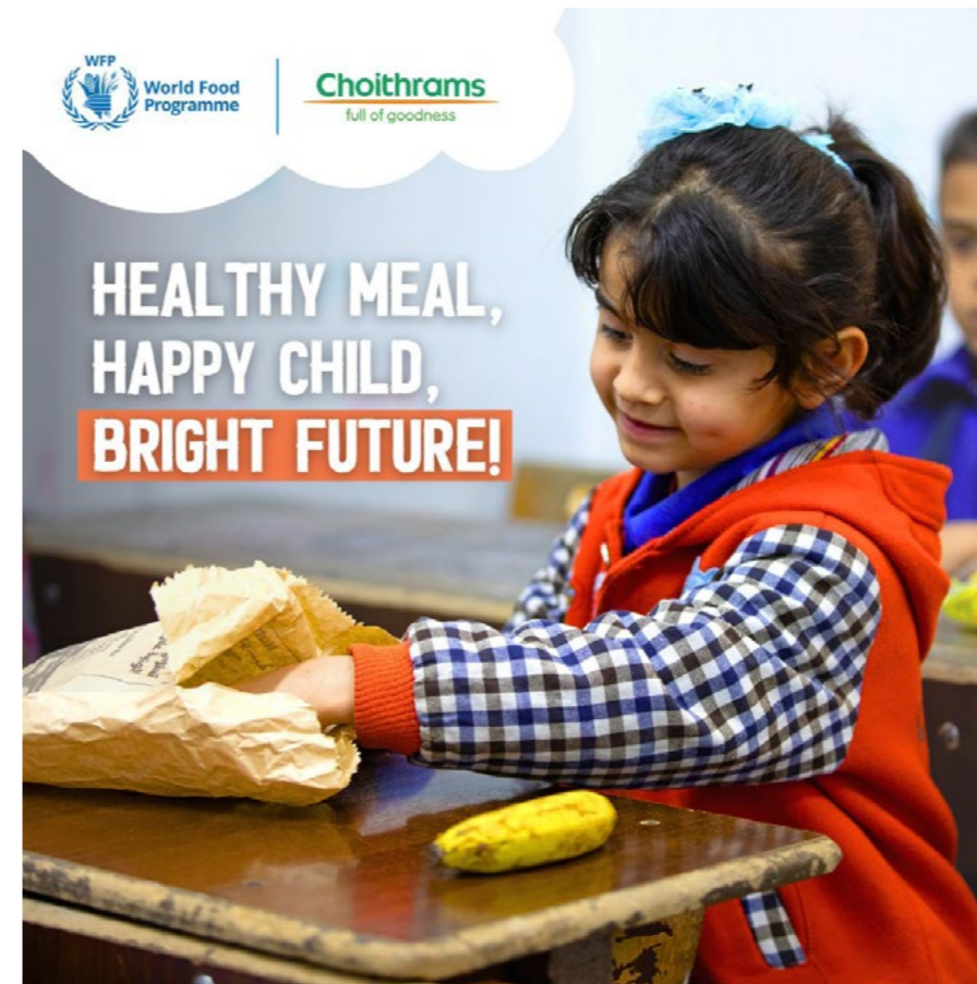
WFP and Choithrams joined forces in a regional campaign to raise awareness and support for SDG 2 - Zero Hunger.