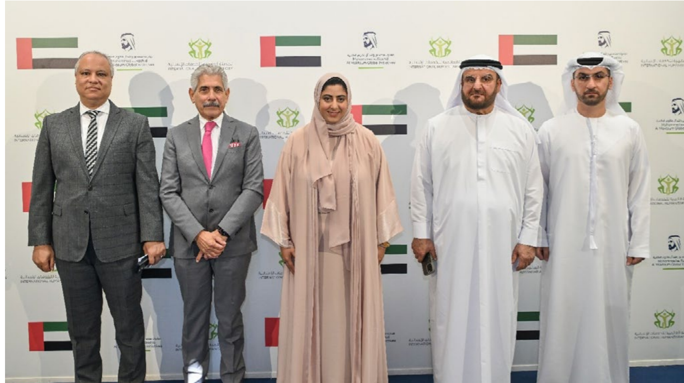
United Arab Emirates, Dubai Humanitarian Emergency Response Workshop 2024