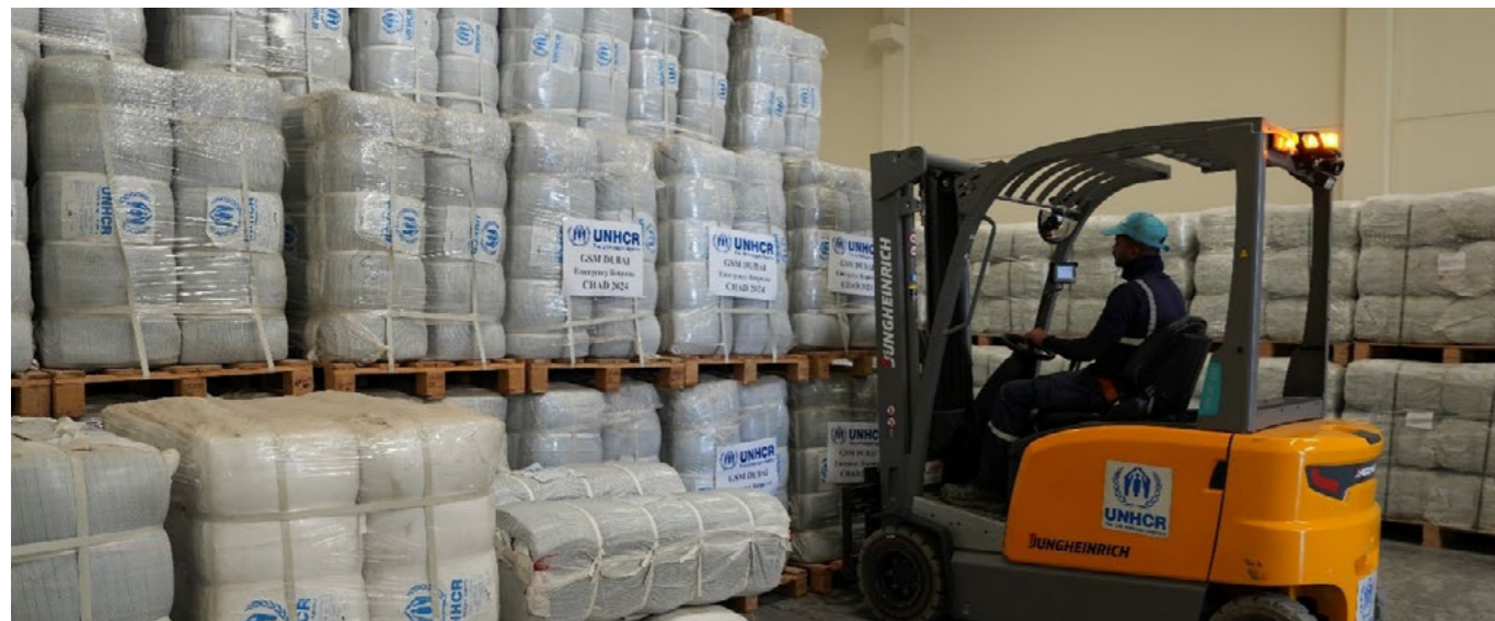
United Arab Emirates. UNHCR airlifts 50 metric tonnes of relief items to support refugees in Chad.