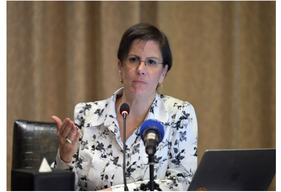
UN Special Rapporteur on violence against women and girls, Reem Al Salem, addresses the press at the conclusion of her official visit to the UAE, commending the country's progress on gender equality and women's rights.