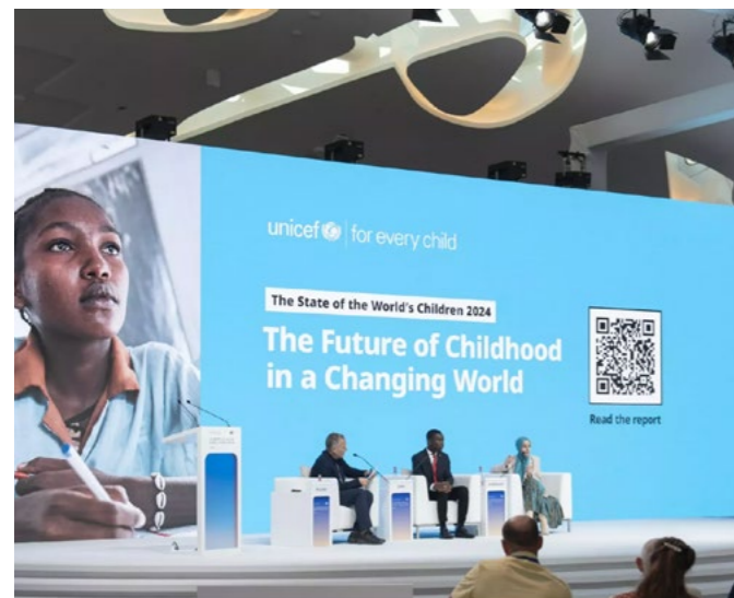
Launch of UNICEF's State of the World's Children report at the Museum of the Future in Dubai.