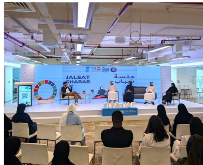
UNFPA and the UN RCQ, in collaboration with the Arab Youth Center host Jalsat Shabab in Abu Dhabi.