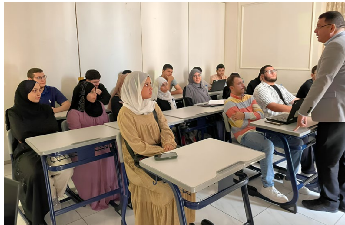
United Arab Emirates, Syrian students between the ages of 18-35 years attended one of AGEF vocational training introduction sessions.